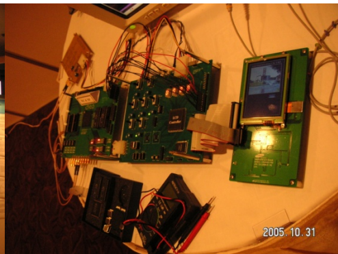
(An example of the demo kit)